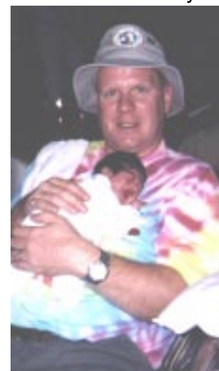
AND THEN THERE WERE 23! Twenty-two Individuals went to Belize but 23 came back to this country. Pictured above is

same complaints as heard in this country.